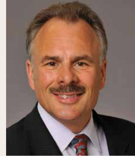
Gord Miller Environmental Commissioner of Ontario

When Premier Kathleen Wynne's Liberal government brought in sweeping legislative changes that undermined numerous environmental protection acts and statutes, including the Endangered Species Act and the Clean Water Act, it refused to post the changes on the Environmental Registry, denying the public an opportunity to comment. In terms of stifling public comment, the Environmental Commissioner, for example, called Wynne's Ministry of Natural Resources a "serial offender."