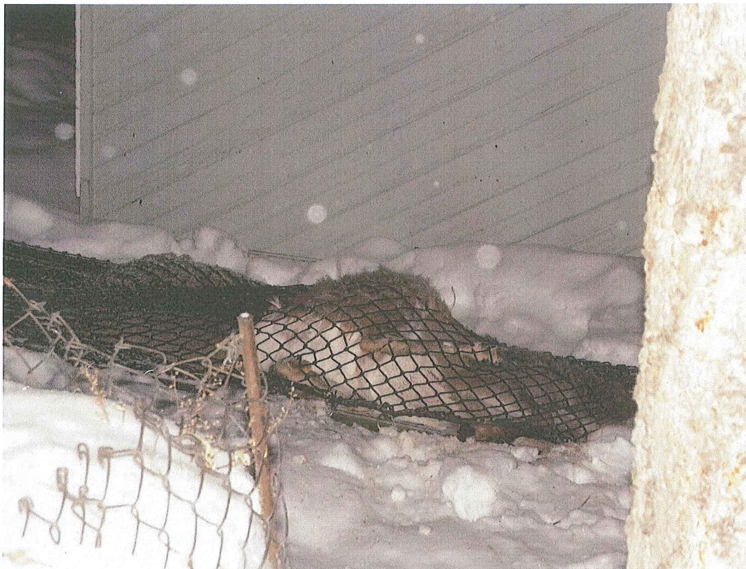
Two live fawns entangled in the collapsed trap Photo taken January 8, 2016